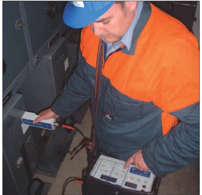
The author making a non-intrusive measurement on the switch tank of an aged Oil filled Circuit Breaker using the Partial Discharge Locator (PDL1) from EA Technology UK.

Results of 4 days continuous Partial Discharge Monitoring. All channels are following Probe 6 located on a switch tank with an average amplitude of 26dB recorded. The aerials CH 1, 2, 11 & 12 are clear confirming that the activity is internal to the switchgear.