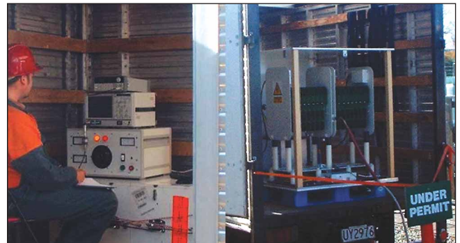
Figure 2 – The instrument control and data capture equipment plus connection to VLF generator out the back of vehicle.

The test equipment is mounted in a cargo van and requires access to within 25 metres of the test subject as well as a standard 10A mains supply. Connection is normally made via the cable termination or spouts of Switchgear, although outdoor potheads and pole terminations in the switchyard can be used if no other option is available. While testing requires the removal of the cable from service and its disconnection at each end, the mapping itself takes only 2hrs to complete with all 3 phases being "soaked" for a minimum of 20 minutes each. Depending on access requirements and with efficient organisation, Mapping of 3 cables per day is generally achieved.